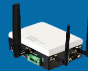
WIRELESS SMART CONTROLLER